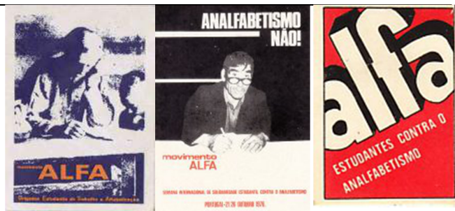
Figure 5 Propaganda posters of the Alfa Movement

According to Mogarro and Pintassilgo (2009, p. 13), this movement’s “organization was highly centralized, with a steering committee and base in the Faculty of Arts of Lisbon, regional commissions, literacy nuclei and mobile and fix brigades, working on a voluntary basis”. Their goals did not only focus on literacy, but also on the “consolidation of the most important revolutionary achievements, such as the Land Reform” (Mogarro & Pintassilgo, 2009, p. 13). Since its politicized nature was greater than the other movements, Alfa was refused state support for the implementation of literacy campaigns on the basis of its strong ideological component.