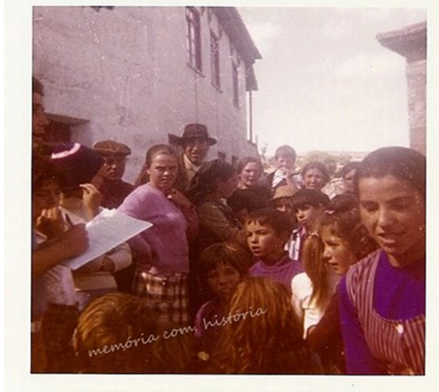
Figure 1. Literacy campaigns in Trás-Os-Montes, September of 1974

Many of these initiatives focused on getting to know the real country, with the goal of shortening the distance between intellectual work and manual labour. One of the main initiatives of this movement of “going towards the people” (Oliveira, 2004a, 2004b) during this period was headed by the Armed Forces Movement (MFA) responsible for the revolution, in the Cultural Promotion and Civic Action Campaigns , reflected in one of its participants’ testimony: