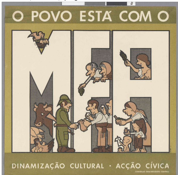
Figure 3. Propaganda poster of MFA initiatives, authored by João Abel Manta (retrieved from http://casacomum.net/cc/visualizador?pasta=04791.036 )