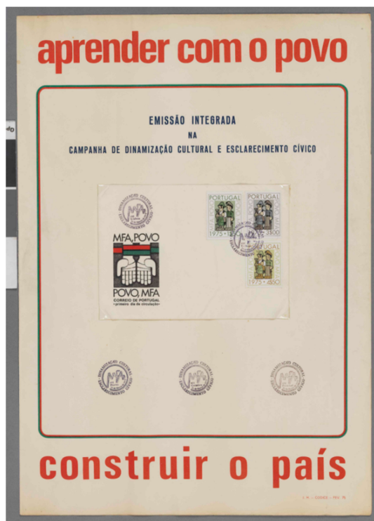
Figure 4. Stamp collection on MFA initiatives, 1975, entitled “learning with the people, building the country” (retrieved from http://casacomum.net/cc/visualizador?pasta=04791.025 )

The military were then seen as educators and, at the same time, as individuals who also needed to learn from the people, as stated in one of the public speeches of Vasco Gonçalves, Prime Minister during these campaigns: